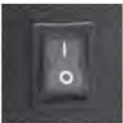
Lighted on/off rocker