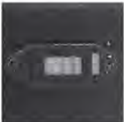
Dual Voltage Selector

ORION FANS fan trays are available in dozens of stock configurations. If you cannot find what you are looking for give us a call. We can design and build your trays from scratch or we can help you come up with solutions for your toughest problems.