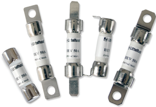
Low Current High Voltage 50A Fuses