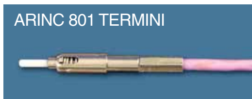
ARINC 801 TERMINI