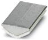
Insertion profile, Color: silver