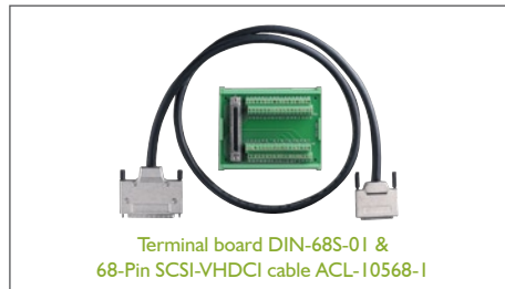
Terminal board DIN-68S-01 & 68-Pin SCSI-VHDCI cable ACL-10568-1