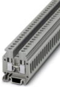
Feed-through terminal block, Connection method: Screw connection, Cross section: 0.2 mm 2 - 4 mm 2 , AWG 24 - 12, Width: 5.2 mm, Color: gray, Mounting type: NS 15

Please be informed that the data shown in this PDF Document is generated from our Online Catalog. Please find the complete data in the user's documentation. Our General Terms of Use for Downloads are valid ( http://download.phoenixcontact.com )