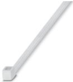
Cable binders for quick and secure bundling, standard version

Please be informed that the data shown in this PDF Document is generated from our Online Catalog. Please find the complete data in the user's documentation. Our General Terms of Use for Downloads are valid ( http://phoenixcontact.com/download )