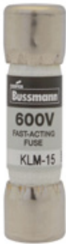
600Vac/dc 1 to 30A