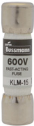
600Vac/dc 1 to 30A