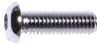
6mm Cap Screws x24