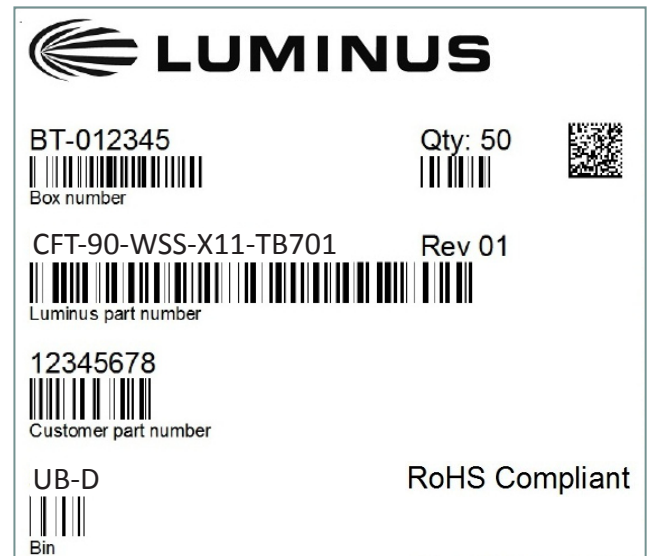
Sample label –for illustration only