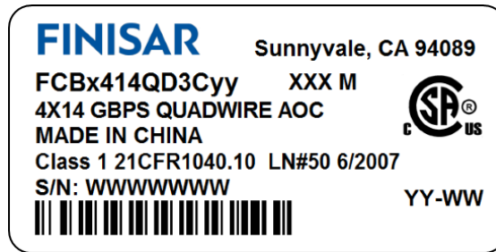
Figure 4 – Quadwire ® production-level product label