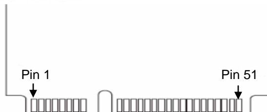
Figure 1-2 Apacer mSATA H1-M pin assignment

Pin assignment of the mSATA H1-M is shown in Figure 1-2 and described in Table 1-3.