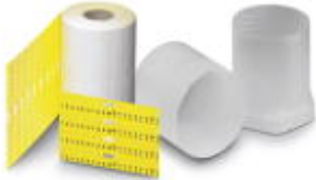
Illustration shows the product TMT 4 R YE

Marker for terminal blocks, can be ordered: By line, white, labeled according to customer specifications, Mounting type: Snap into universal marker groove, Snap into flat marker groove, for terminal block width: 6.2 mm, Lettering field: 6.35 x 6.15 mm