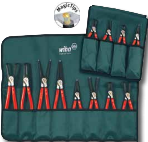
In Canvas Roll-Up Pouch