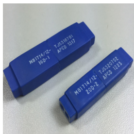
Single In-Line Splices Dual In-Line Splices Electronic Splices