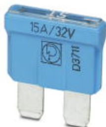
Flat-type plug-in fuse, type C, color code: pink, nominal current: 4 A

Please be informed that the data shown in this PDF Document is generated from our Online Catalog. Please find the complete data in the user's documentation. Our General Terms of Use for Downloads are valid ( http://phoenixcontact.com/download )