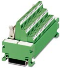
VARIOFACE module, with screw connection and flat-ribbon cable connector, for assembly on NS 35/7.5, 64 positions

Please be informed that the data shown in this PDF Document is generated from our Online Catalog. Please find the complete data in the user's documentation. Our General Terms of Use for Downloads are valid ( http://phoenixcontact.com/download )