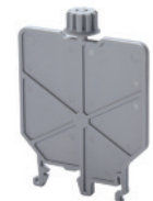
Mounting Accessories for CTSPC