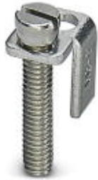
Switching jumper, Number of positions: 2, Color: silver

Please be informed that the data shown in this PDF Document is generated from our Online Catalog. Please find the complete data in the user's documentation. Our General Terms of Use for Downloads are valid ( http://phoenixcontact.com/download )