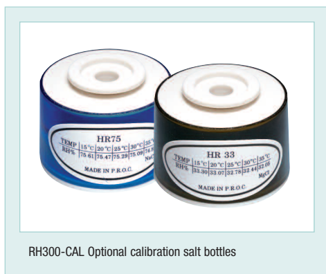
RH300-CAL Optional calibration salt bottles