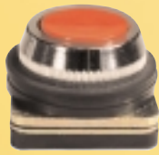
Flush Non Illuminated Momentary