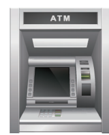
Vending Machine, ATM