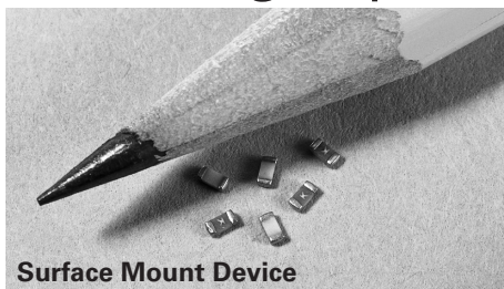
Surface Mount Device