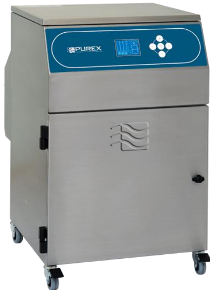
Model 200 / 400

Recirculating fume extraction is now extremely important with the rising concern for our environment and employee safety. Purex Fume Extractors provide not only a flexible and portable process for plant redesigns and expansions, but also a more stable process by providing a controlled airflow to remove harmful fumes. All this while eliminating the added costs of building modifications, increased air handling systems and lost energy.