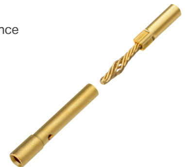
Detail of Dura-Con™ Twist Pin