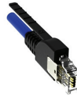
With Pull Tab PNs 2100356/357 PNs 2142758/759