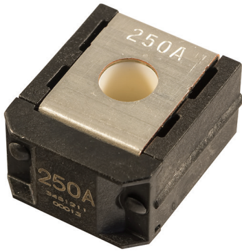
ZCASE Single Mega/Starter Fuse