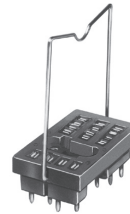
Hold down spring