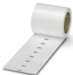
Snap-in marker, for marking Inline modules

Please be informed that the data shown in this PDF Document is generated from our Online Catalog. Please find the complete data in the user's documentation. Our General Terms of Use for Downloads are valid ( http://phoenixcontact.com/download )