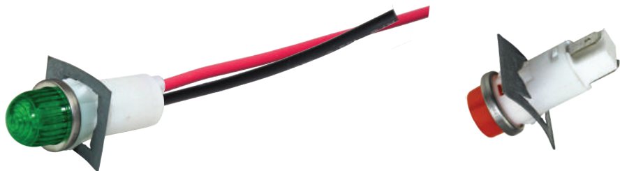
Examples: SN0461-C in Panel Mount Indicators