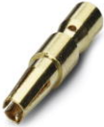
Crimp contact, turned, contact diameter: 1.5 mm, crimp range: 0.08 mm 2 ... 0.22 mm 2

Please be informed that the data shown in this PDF Document is generated from our Online Catalog. Please find the complete data in the user's documentation. Our General Terms of Use for Downloads are valid ( http://phoenixcontact.com/download )