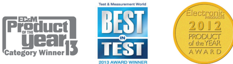
Figure 1. Award winning U1177A Infrared (IR)-to- Bluetooth adapter is being recognized as an innovative solution in Test & Measurement industry

Keysight Technologies, Inc. U1177A Infrared (IR)-to- Bluetooth adapter offers wireless remote connectivity solution via Bluetooth connection simply by attaching the adapter to the IR port of a Keysight handheld digital multimeter. The wireless remote connectivity is set up when a Keysight handheld digital multimeter is connected to U1177A and an Android device (tablet or smart phone) with the installed software. Every U1177A also has a unique Media Access Control (MAC) address. User can quickly and easily scan for the right U1177A using their Android device and pair up with the U1177A.