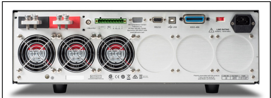
Model 2380-500-30 rear panel