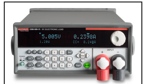
Model 2380-500-15 front view showing the safety covers on the input terminals.