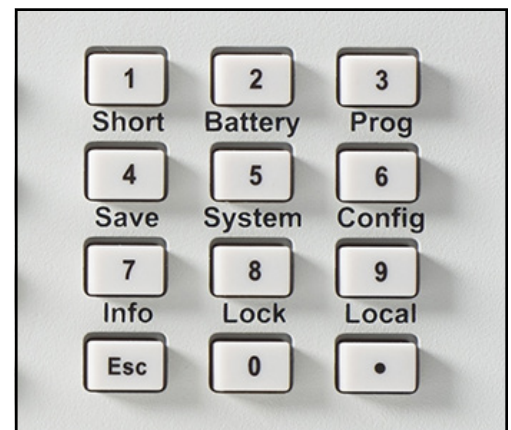
Figure 1. Use either the rotary knob or the keypad to quickly enter settings and set parameter values using all the available resolution.