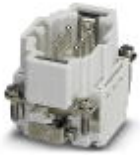
HEAVYCON male insert, B6 series, 6-pos., push-in connection

Contact insert - HC-B 6-I-DT-M - 1648131