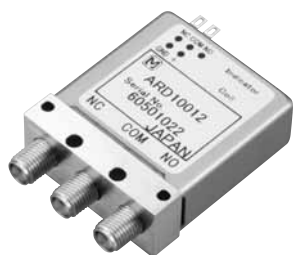
18 and 26.5GHz types