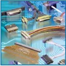
Microdot Connectors and Cables