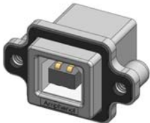
MUSB-D111-30 TYPE B, RIGHT ANGLE