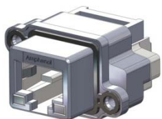
MRJR-538X-01 SHOWN RIGHT ANGLE, PCB TAIL, 8 POSITION RJ45