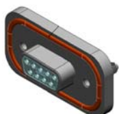
9 POSITION CONNECTOR SHOWN