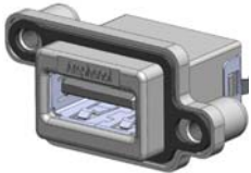
MUSBR-A511-40 TYPE A, VERTICAL, LOW PROFILE