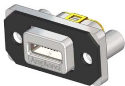
MUSB-K152-30 SERIES MICRO-AB RIGHT ANGLE, PCB TAIL