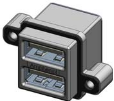
MUSB-C111-30 TYPE A, STACKED, RIGHT ANGLE