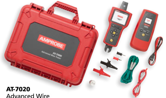
AT-7020 Advanced Wire Tracer Kit