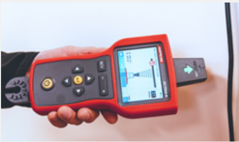
Non-contact voltage (NCV) detection.