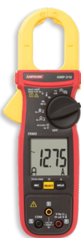
AMP-310 AC Clamp Meter HVAC