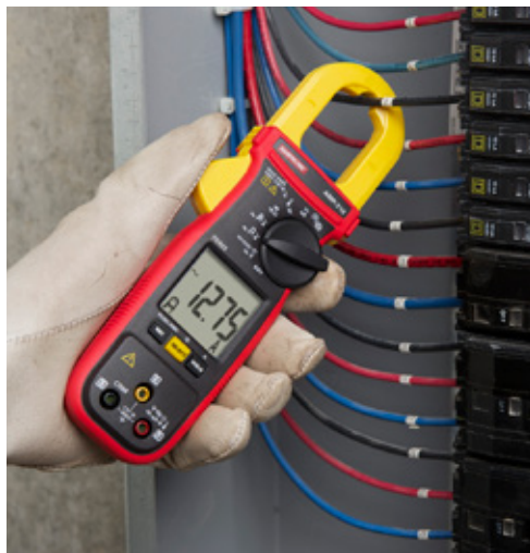
AMP-310 AC Clamp Meter HVAC