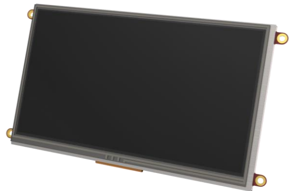
The uLCD-70DT Display Module

NOTE (*): Arduino remains the property of the Arduino Team. All references to the word Arduino and Arduino Hardware are licensed under the Creative Commons Attribution Share-Alike license.