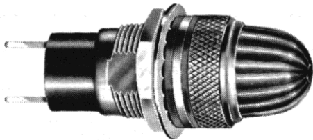
377-0410-1191-203 Stovepipe lens