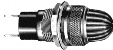
377-0410-1191-203 Stovepipe lens