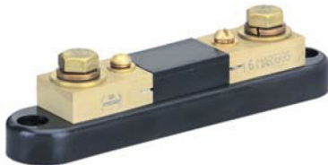
50mV Shunts Portable 150 amp Catalog No. 06714

Leads for these shunts are 5 feet long and are rated at 0.065 ohms resistance. Shunts with a 100 amp rating and below can be certified to NIST standards.