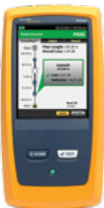
More on page 20