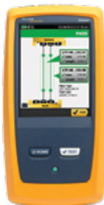
More on page 21