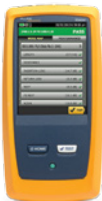
More on page 5

Faster systems acceptance for all copper and fiber certification jobs.