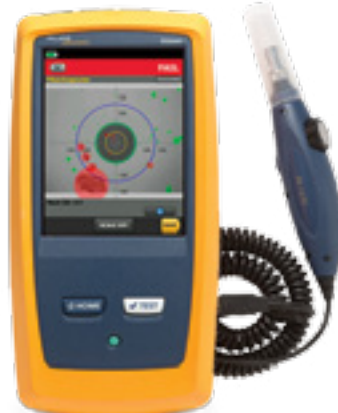
More on page 28