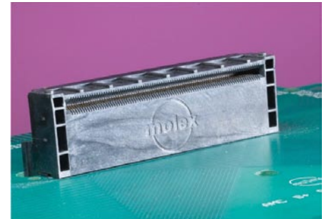
Series 75800 Standard AMC.0 B+ Connector

AMC.0 B+ connectors from Molex support the next generation of mezzanine card standards and 12.5 Gbps speeds