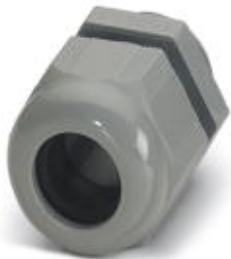
Cable gland, Cable gland material: Polyamide 6, External cable diameter 5 mm ... 10 mm, Shielding: No, Connecting thread: NPT3/8 inch, Color: silver grey

Please be informed that the data shown in this PDF Document is generated from our Online Catalog. Please find the complete data in the user's documentation. Our General Terms of Use for Downloads are valid ( http://phoenixcontact.com/download )