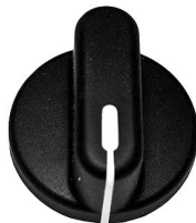
5940E, 5920E, 5930E