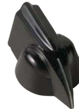
5600E, 5601E, 5602E